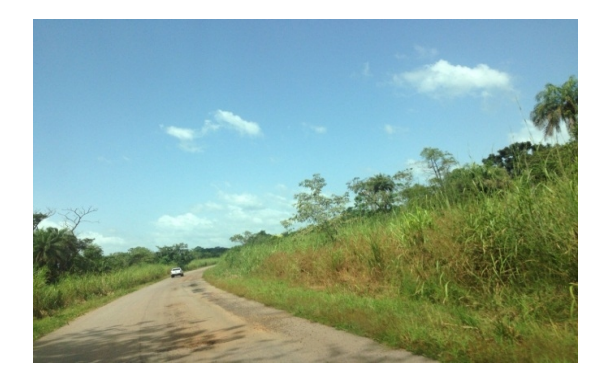
Rogbere junction to Guinea Boarder