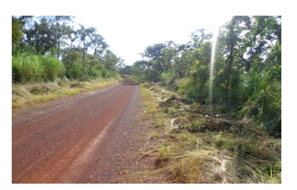
Ojuku Junction to Waterloo