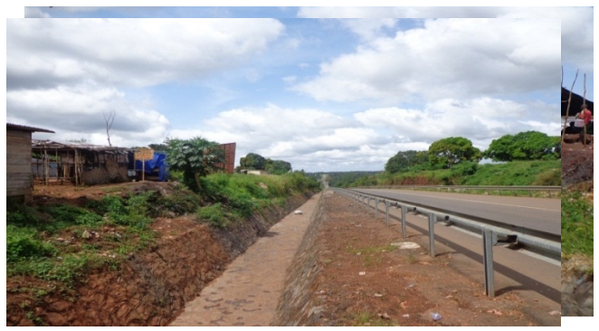
Magbontoso- Cottage Road, Port Loko District

Surface and Drainage Clearing (Routine Maintenance) Rogbere Junction to Guinea Border , Kambia District