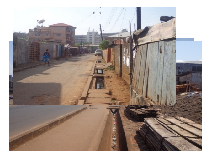
Black Hall Road