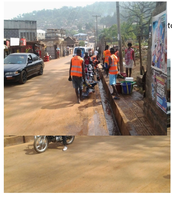
town City Council