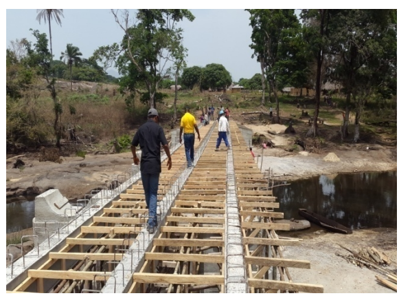
Construction of Lebanon- Kainsay Bridge, Kono District