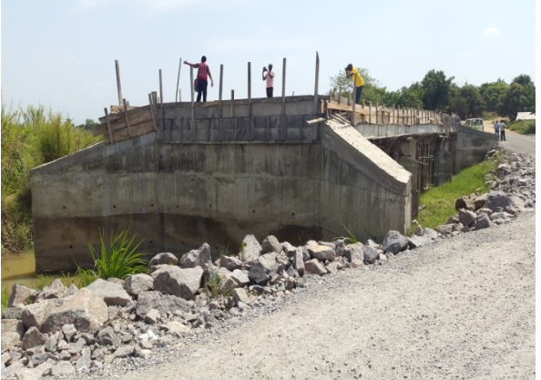
Construction of Mambolo- Rokel - Bridge, Kambia District