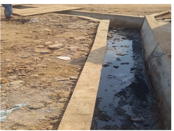
Lot 5 (1 ) Lot 5(2)