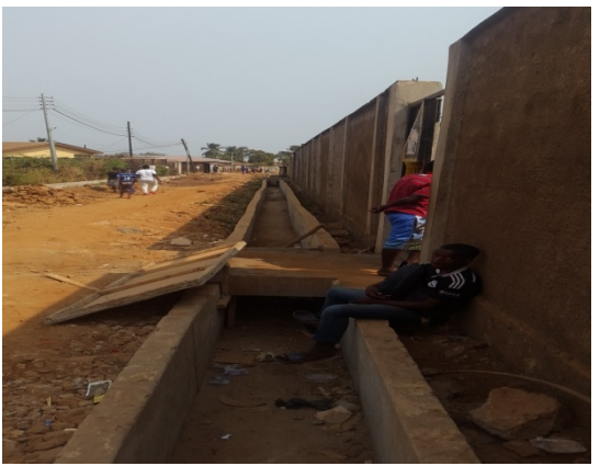
Lot 3 Lot 4