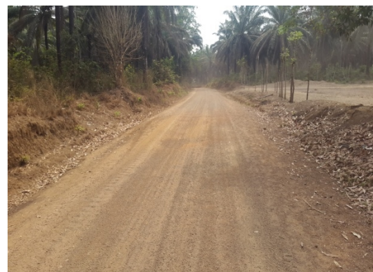
Kambia to Tomparie (Lot 1&2)