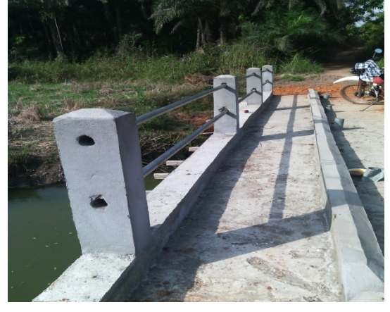
Emergency Maintenance works on Magbele Bridge