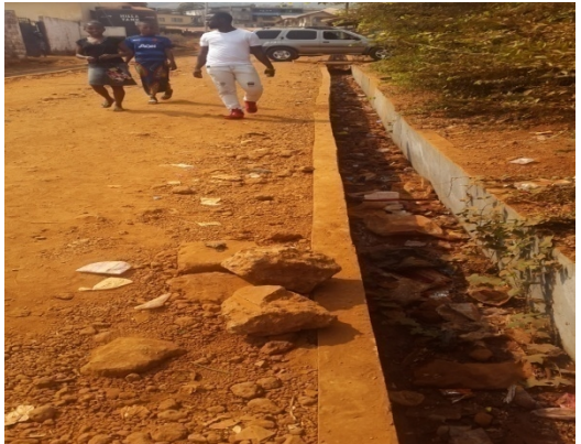
Lot 1 Lot 2