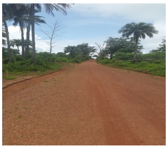
Construction of Kundi Bridge, kono District